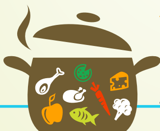
Quick recipe ideas