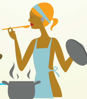
Tasty recipe samples